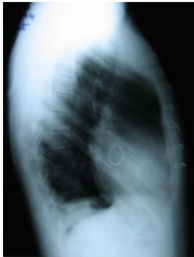
(Fig 2 :Lateral view Xray chest showing the annuloplasty ring)

He underwent mitral valve repair through a complete midline sternotomy using cardiopulmonary bypass. Intra-operatively, after routine left atriotomy, cold saline was carefully instilled into the left ventricle, to identify the prolapsing segment of the anterior mitral leaflet and the area of resection. The segment of anterior mitral leaflet prolapsing into the left atrium was resected, sparing major chordae while keeping clear of the annulus. The free edges of the remaining anterior leaflets were sutured using 3/0 Ticron sutures and the annuloplasty was performed using 32 size Carpentier-Edwards ring